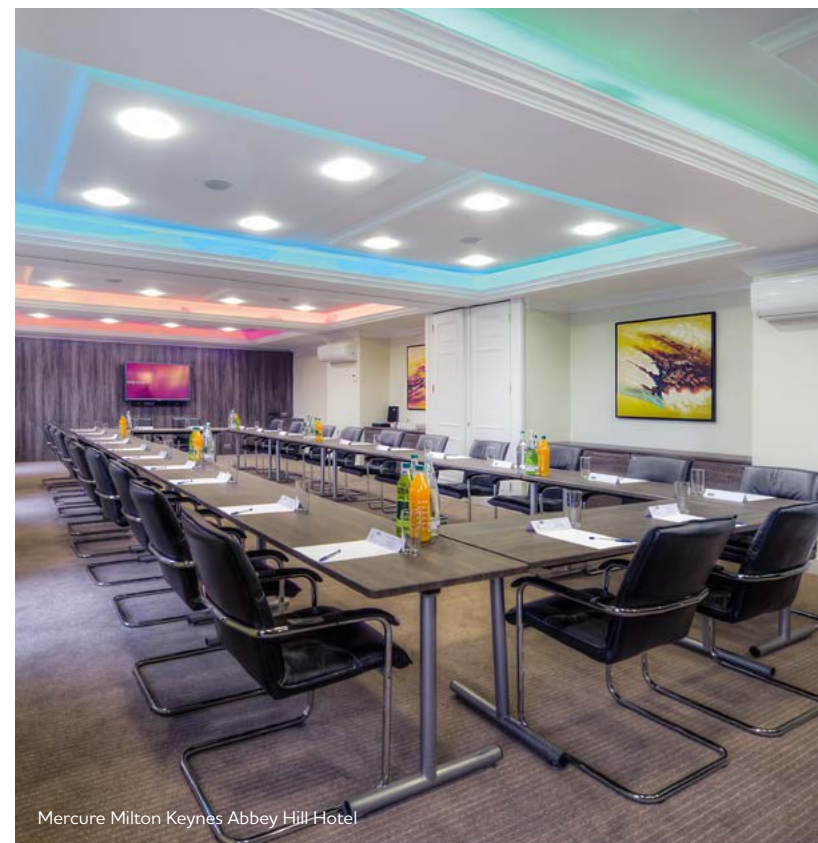
Mercure Milton Keynes Abbey Hill Hotel

Simply contact the meetings team at your hotel of choice to discuss your individual requirements.